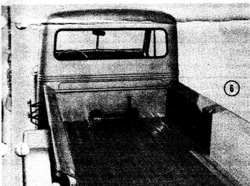
Fig. 6 — Model AA-200 L Bed Mount Winch Kit, for 4WD Jeep Truck. Driven by front half of Jeep power take-off. An excellent light duty wrecker unit can be built around this winch installation. When ordering, please specify year truck was made.